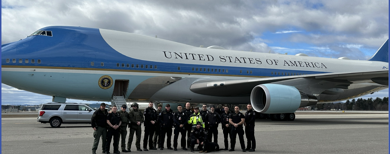
Londonderry Police Airport Division officers in front of Air Force One during President Biden's New Hampshire visit in March 2024.