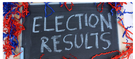
Municipal Election Results pages 6-7