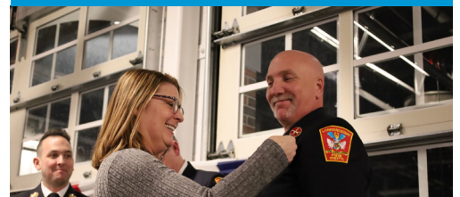
LFD Recognition Ceremony pages 2-3