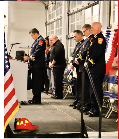
Fire & Town leadership observe a moment of silence